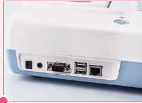
USB port for data export