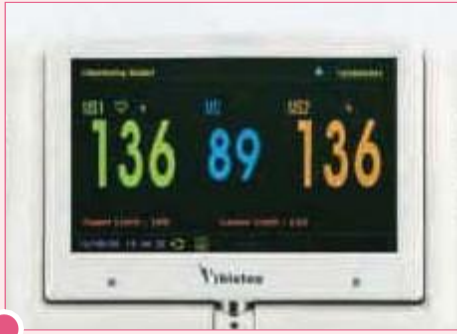
BT-350 LCD Number mode