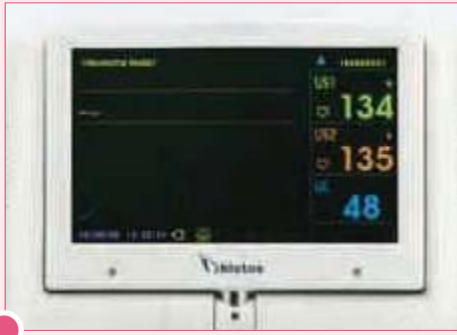
BT-350 LCD Graphic mode